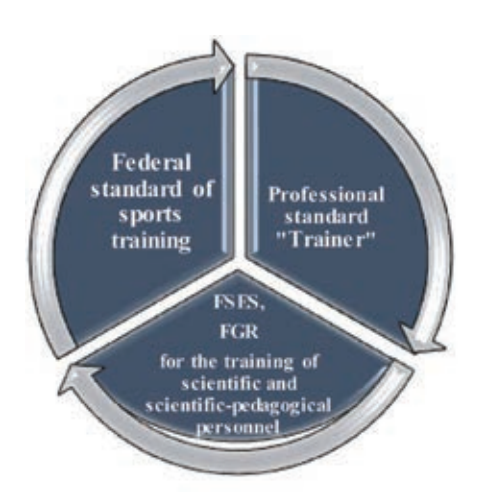
Figure 2. Logical diagram of the relationship of documents regulating educational, scientific and sports activities in the field of physical culture and sports

The content of the main professional educational programs aimed at training personnel for the field of physical culture and sports, first of all, takes into account the Federal State Sports Training Standards, which should be developed by specialists in a particular sports discipline and based on scientific evidence. Only such a document can be effectively implemented in organizations that train the sports reserve. The professional standard of a sports coach takes into account the Federal Standard for Sports Training and all the scientific knowledge that underlies its development. The Federal State Educational Standard (FSES) and the Federal State Requirements (FGR) regulate the design of basic professional educational programs, taking into account the requirements of the Federal State Standards for Sports Training and professional standards for sports and scientific personnel who ensure the development of documents and the implementation of professional activities in each subsequent cycle.