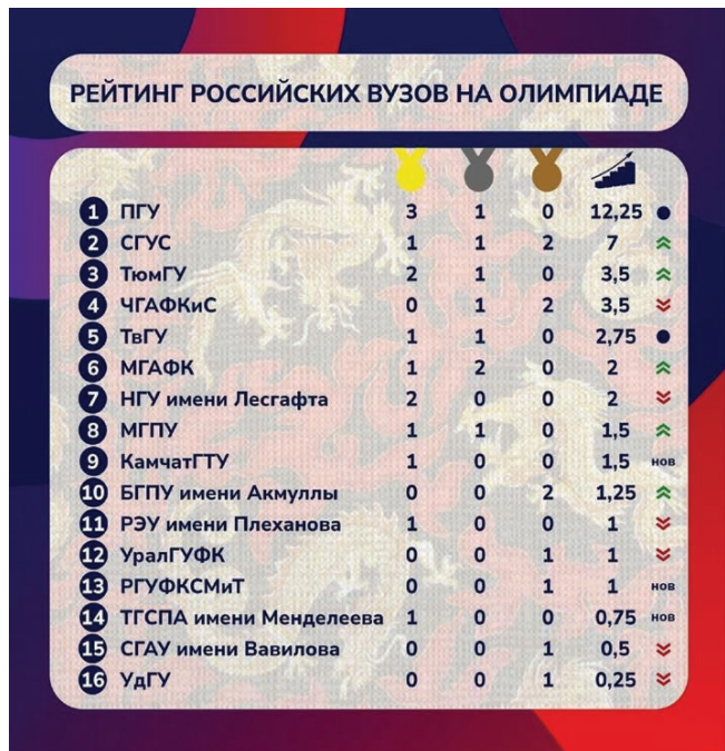
Ranking of Russian Universities at the Winter Olympic Games in Beijing

The Internet media «Studentsport.ru» published a ranking table of universities by the number of medals of students and graduates - participants in the 2022 Olympic Games in Beijing (see figure).